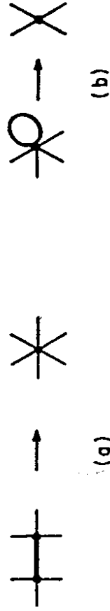
Fig. 3. (a) Replacement of propagator with (\partial L / \partial \phi)^2 vertex. (b) Replacement of propagator with (\partial^2 L / \partial \phi^2) vertex.