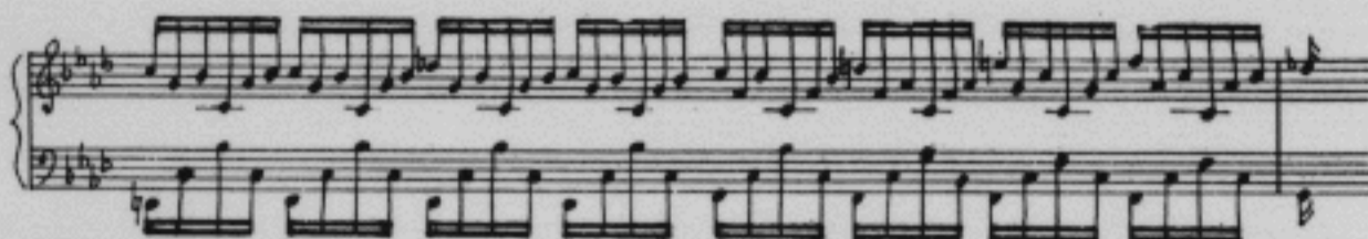
A passage from Chopin's Etudes op. 25, no. 1 demonstrates a symmetrical path visually and melodically.