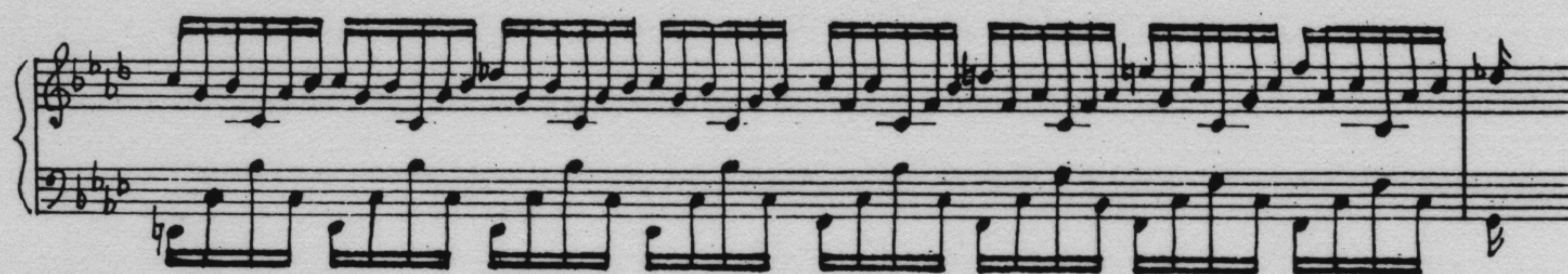
A passage from Chopin's Etudes op. 25, no. 1 demonstrates a symmetrical path visually and melodically.